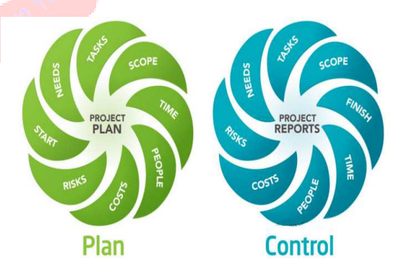
Figure 1: Plan and Control Analysis

The application will have different formulizations of methodology for the consideration of communication and coordination that will be helpful for the organization to have undertaking where all the management process and procedures can be managed. The organization will have a total control over the venture management effect as the application will include different types of report processes with respect to the manager formations. The related status will be provided to the users so that controlled setup revisions can be provided in concern to the development Strategies and Management.