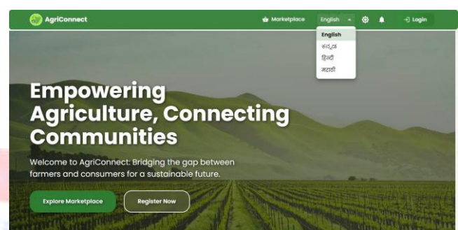
Fig 1. Home Page

and every endpoints to be rate limited for the prohibition of the abuse or the dos attacks and other malpractices done or tried to be executed for the bad intentions to be controlled and managed gracefully with perfection without any disturbance to the project functionalities with the securing of the users and the data to be safe and private with perfect user management..