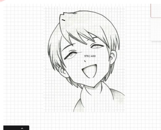
Fig. 3. Image editing on whiteboard