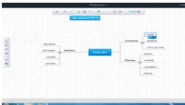
Checking mapping style