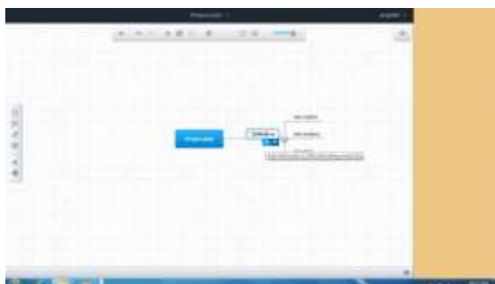
Options for working area (new mind map project plan)