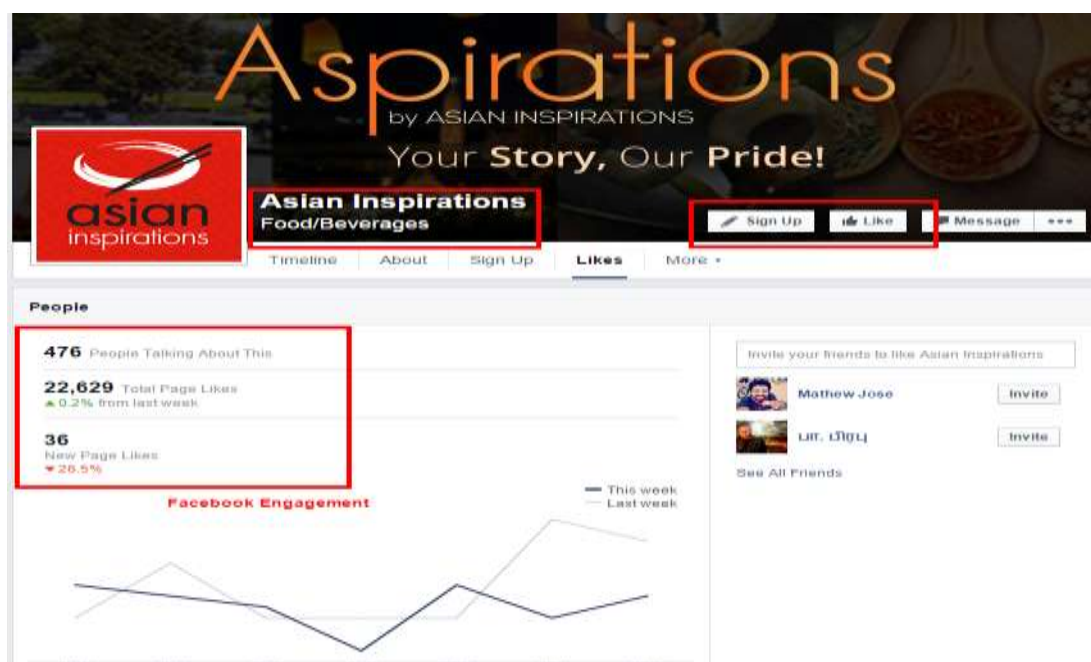
Figure 2: The System Application and Review