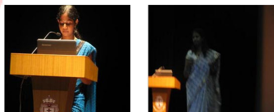
Figure 6: Occluded, non-orthogonal, distant from focus

The detected images are classified into pre-determined groups based on the content of the image through person, object identification and the context of the event. The images are then tagged with the classified group id.