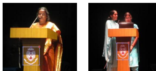
Figure 2 : Positive Samples with logo object as ROI