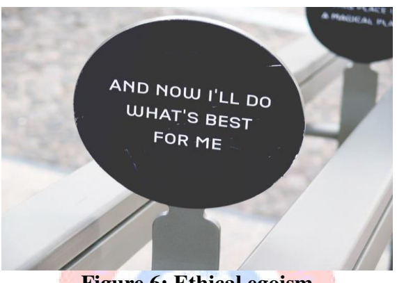
Figure 6: Ethical egoism

others). But it also holds that one should not (as altruism does) sacrifice one's own interests to help others' interests, so long as one's own interests (i.e. one's own desires or well-being) are substantially equivalent to the others' interests and well-being. Egoism, utilitarianism, and altruism are all forms of consequentialism, but egoism and altruism contrast with utilitarianism, in that egoism and altruism are both agent-focused forms of consequentialism (i.e. subject-focused or subjective). However, utilitarianism is held to be agent-neutral (i.e. objective and impartial): it does not treat the subject's (i.e. the self's, i.e. the moral "agent's") own interests as being more or less important than the interests, desires, or well-being of others