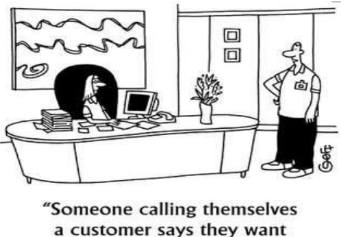
something called service."

These are days when terms such as ethics are very much forgotten. But customer is unforgiving and remembers all your interactions and tries to evaluate them based on his value system sometimes also called ethics.