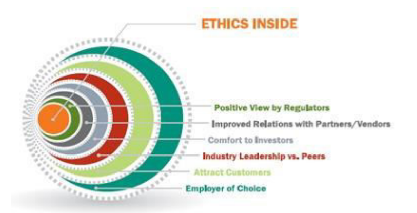
Figure 5: Ethics 'INSIDE' and 'OUTSIDE'

acknowledged by regulators, and very importantly stock holders and share holders. Ethical behavior of a company is reflected in terms of its relationships with vendors and suppliers and other business partners. Investor comfort is critical to attract investment in the company for which they have to be convinced of the ethical standards maintained by the company, inside and outside. The company is always in focus by industry in which it is a member and has to be guided by best practices followed by industry standards and accepted by them. Moreover the industry leadership depends on the conduct of the peers in the group who set examples by their exemplary behavior and conduct.