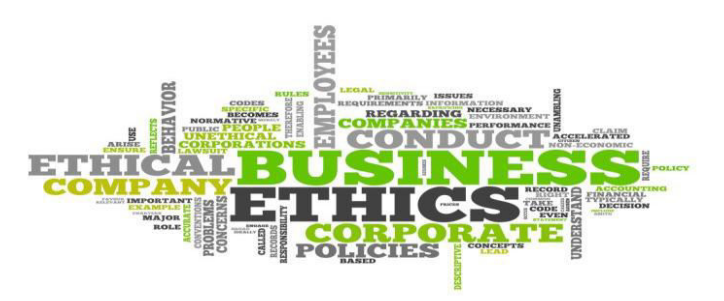
Figure3: Business ethics

This can happen at the Business Development Manager level also. In order to gain access to a new territory or account the business development manager cannot close his eyes to wrong sales. Online business is quite popular because of the easiness of transactions. But it has the potential to destroy the product and company as the word gets around faster than the sales. The word of mouth publicity is the most hurtful as well as most rewarding, if it is for the proper reasons. Marketing managers have the added responsibility to be careful that the bad publicity does not hurt long term business and problems have to be fixed quickly. This is where business ethics form the fundamental basis of any business.