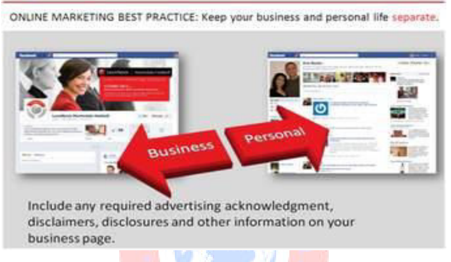
Figure2: Ethics in online business

that is quoted and will be of use to him in improving his business or personal situation. The enthusiastic sales personal at the customer contact and first level may be happy to conclude a sale. But it is for the marketing and senor personnel in the corporate ladder to decide whether such sales are genuine. A business is built on the reputation of the company and its sales contact persons who are in touch with customers create the image. If the sales person making a sale is genuinely happy that the customer has bought his product and it will be of good use and service to him, it is good. But if it is another one off gimmick to increase sales volume and fulfill his quota, it is detrimental to the company in the long run.