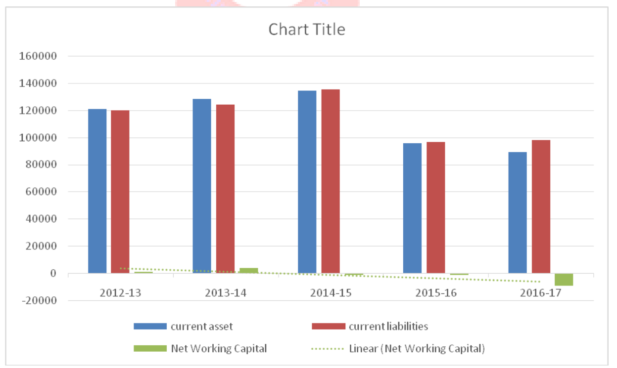
Bar Graph showing Working Capital including Current Assets and Liabilities Working Capital leverage

Net working Capital (NWC) =Current assets-Current liabilities