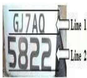
(b) Number plate with lines