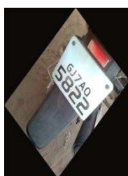
(a) Skewed image