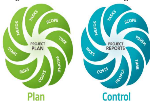
Figure 1: Plan and Control System

The application will have different formulations of methodology for the consideration of communication and coordination that will be helpful for the organization to have undertaking where all the management process and procedures can be managed. The organization will have a total control over the venture management effect as the application will include different types of report processes with respect to the manager formations. The related status will be provided to the users so that controlled setup revisions can be provided in concern to the development Strategies and Management.