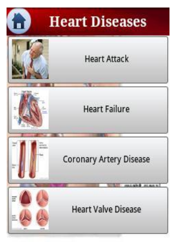
Fig. 10 Snapshot 9