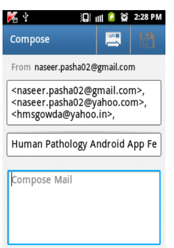
Fig. 7 Snapshot 6