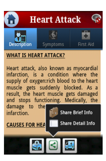
Fig. 9 Snapshot 8