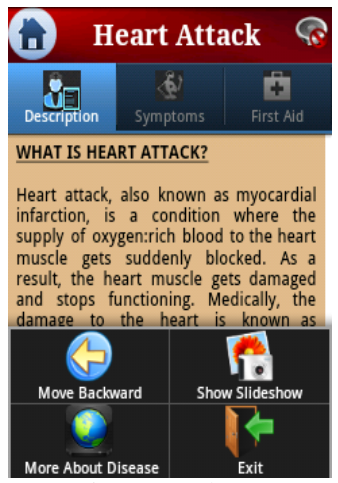
Fig. 6 Snapshot 5