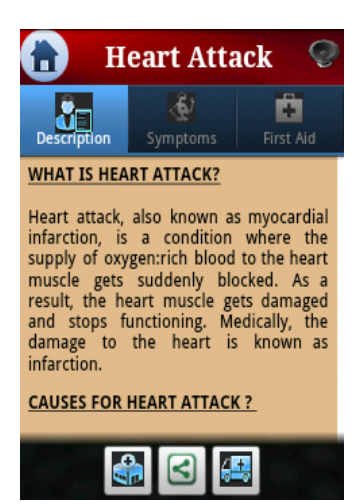
Fig. 5 Snapshot 4