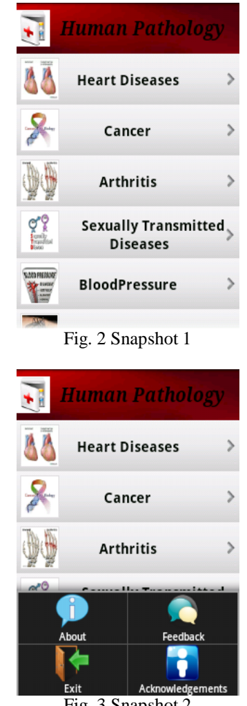
Fig. 3 Snapshot 2

The look and feel of the developed app is as given below.